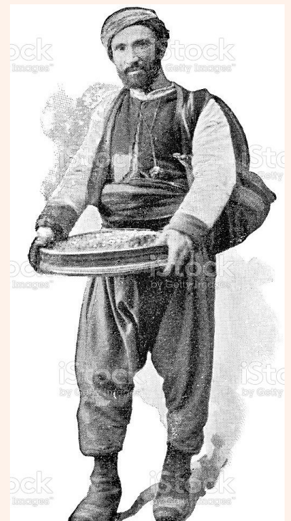
Istanbul street vendor

"Soundscapes of Detention in Cold-War Greece: From Sonic Enclosure to Acoustic Witnessing"