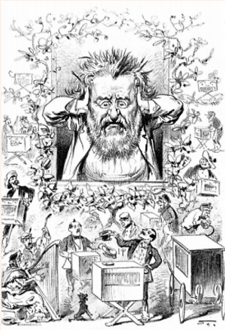
"Wiener Luft". Beiblatt zum Figaro.